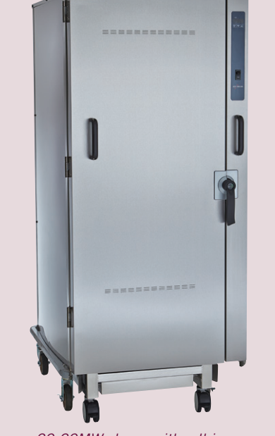
20-20MW shown with roll-in pan cart