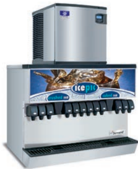
iT420 ice machine on Multiplex® MDH-302 beverage dispenser

Manitowoc dice or half dice cubes crushed into small pieces using a Manitowoc machine and a Multiplex® beverage dispenser equipped with icepic® ice crusher. Provides a selection