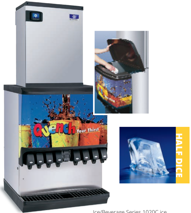
Ice/Beverage Series 1020C ice machine on Multiplex SV-250 beverage dispenser

This compact Ice/Beverage Series ice machine is available in high volume ice production capacities to satisfy nearly every beverage dispenser application at quick service restaurants, convenience stores, recreational or educational foodservice operations.