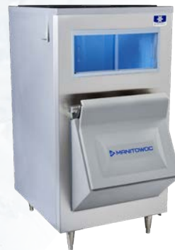
LB-Style Large Capacity Ice Storage Bins

Available in 22" (55.9 cm), 30" (76.2 cm) and 48" (121.9 cm) widths.