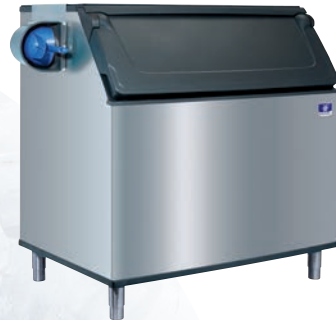
D-Style Ice Storage Bins

Available in 22" (55.9 cm), 30" (76.2 cm) and 48" (121.9cm) widths. Featuring one-piece corrosion-free composite-resin base, impact-resistant polyethylene bin liner, soft durameter trim that helps silence bin closing, built-in internal scpp holder and corrosion and smudge resistant Duratech metal finish. Optional Multi-mount external scoop holder also available.