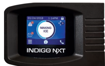
easyTouch ® Display