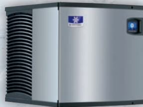
Modular Ice Machines

Featuring high volume dispensing with patented push-for-ice or touch-less lever activated ice chute. Available in ice only or ice and water dispensing.