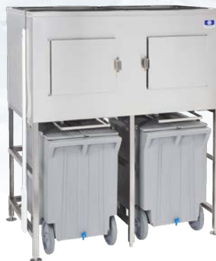
LBCS1360- Large Bin Cart System

Large Upright Style bins are (FIFO) ice first in , ice first out. Made with corrosion restant 304 stainless steel, rust-free polypropylene liner and spring loaded hinged door for easy access to ice.