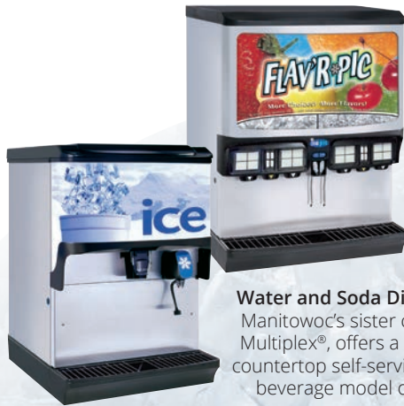
Water and Soda Dispensers Manitowoc's sister company, Multiplex®, offers a complete countertop self-service ice and beverage model offering.

Find the perfect ice machine pairing with Manitowoc's wide variety of ice storage bins and dispensers.