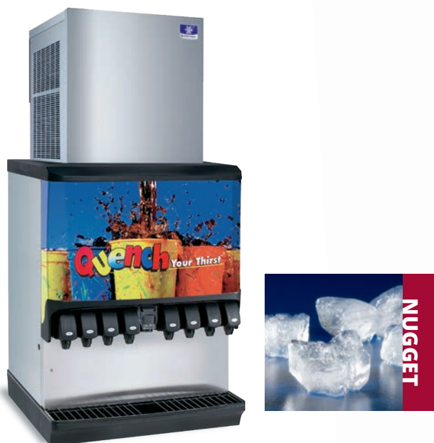
RNP0320 nugget ice machine on Multiplex® SV-250 beverage dispenser