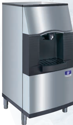
SPA and SFA Series Ice Dispensers

Available in 22" (55.9 cm), 30" (76.2 cm) and 48" (121.9cm) widths. Featuring one-piece corrosion-free composite-resin base, impact-resistant polyethylene bin liner, soft durameter trim that helps silence bin closing, built-in internal scpp holder and corrosion and smudge resistant Duratech metal finish. Optional Multi-mount external scoop holder also available.