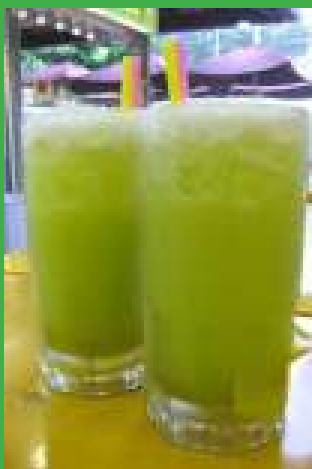
Serve Over Ice