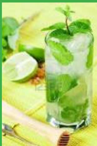
Mix for Mojitos